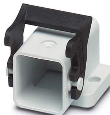
Illustration shows the angled version

http://eshop.phoenixcontact.de/phoenix/treeViewClick.do?UID=1772272